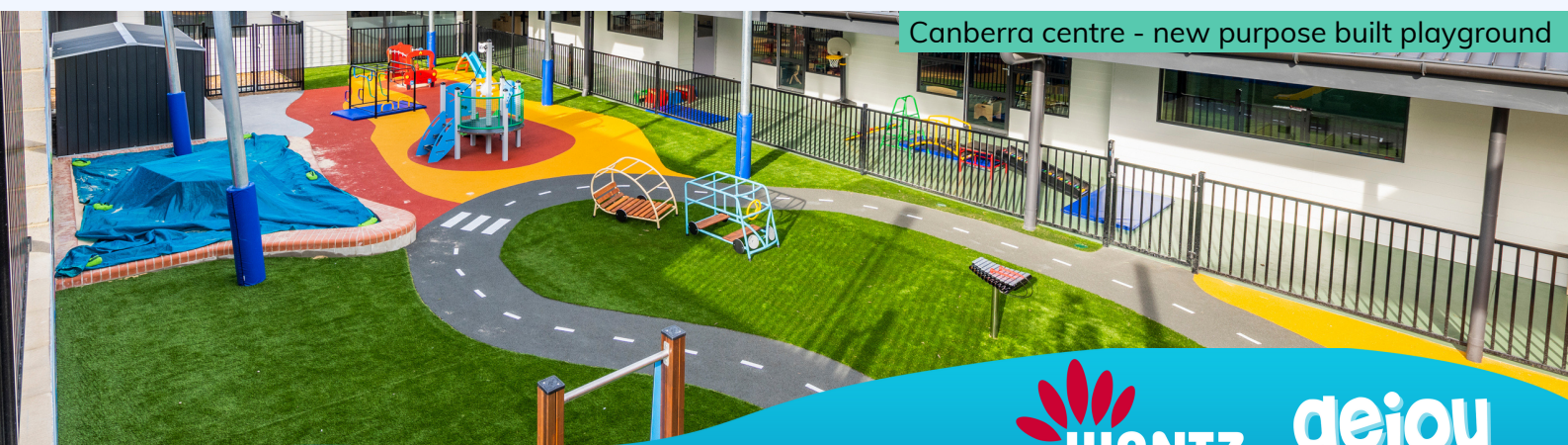
Canberra centre - new purpose built playground